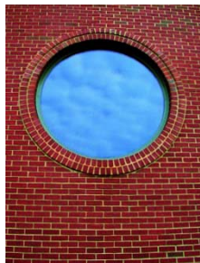
Reflections of clouds in our west sanctuary window

Fellowship Groups (or fun groups) are groups which anyone can attend (perhaps need not even "join") and they may have a programming function, but provide the members of the group affiliation with like-minded Emersonians. These are open to all—and all are encouraged to find friendship and fellowship in one or more fun groups!