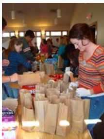
100+ Bagged Lunches for the Homeless

pation in chapel functions and social outreach projects and grow the number of new members and friends.