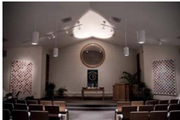
A Heart Inside

Almost Everything You Ever Wanted to Know About Emerson- An Abbreviated Version A full version will be available 9/1/10