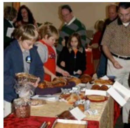
Bread Service 2006