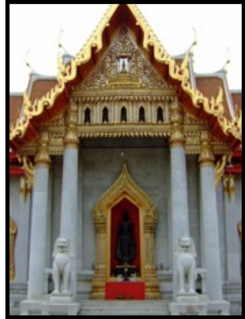
Phyllis MacLaren's photos continue on display in the sanctuary through November